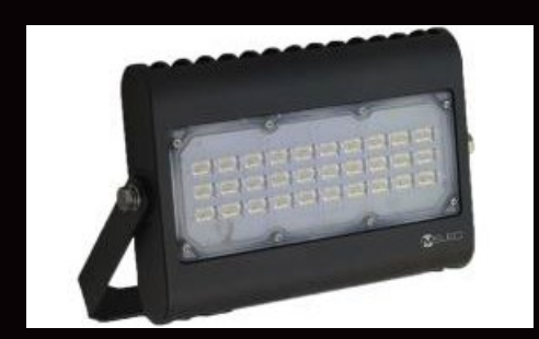
EXTERNAL FLOOD LIGHTS

FINISH SELECTION LED M-ELEC NOX 50w ON daylight timer