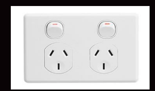
SWITCH & POWER POINTS